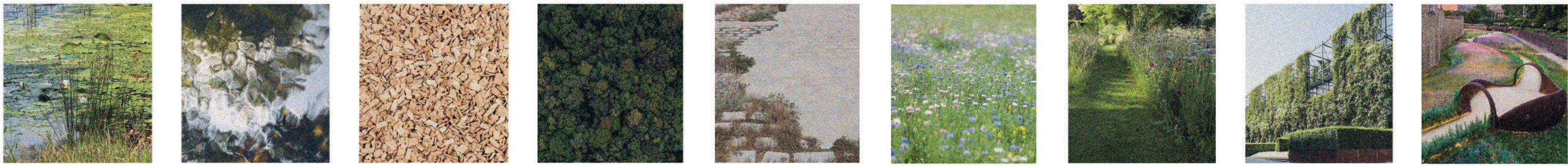
Conceptual section along the Green Axis, 1:800 – illustrating spatial atmosphere, material and texture palette, and program