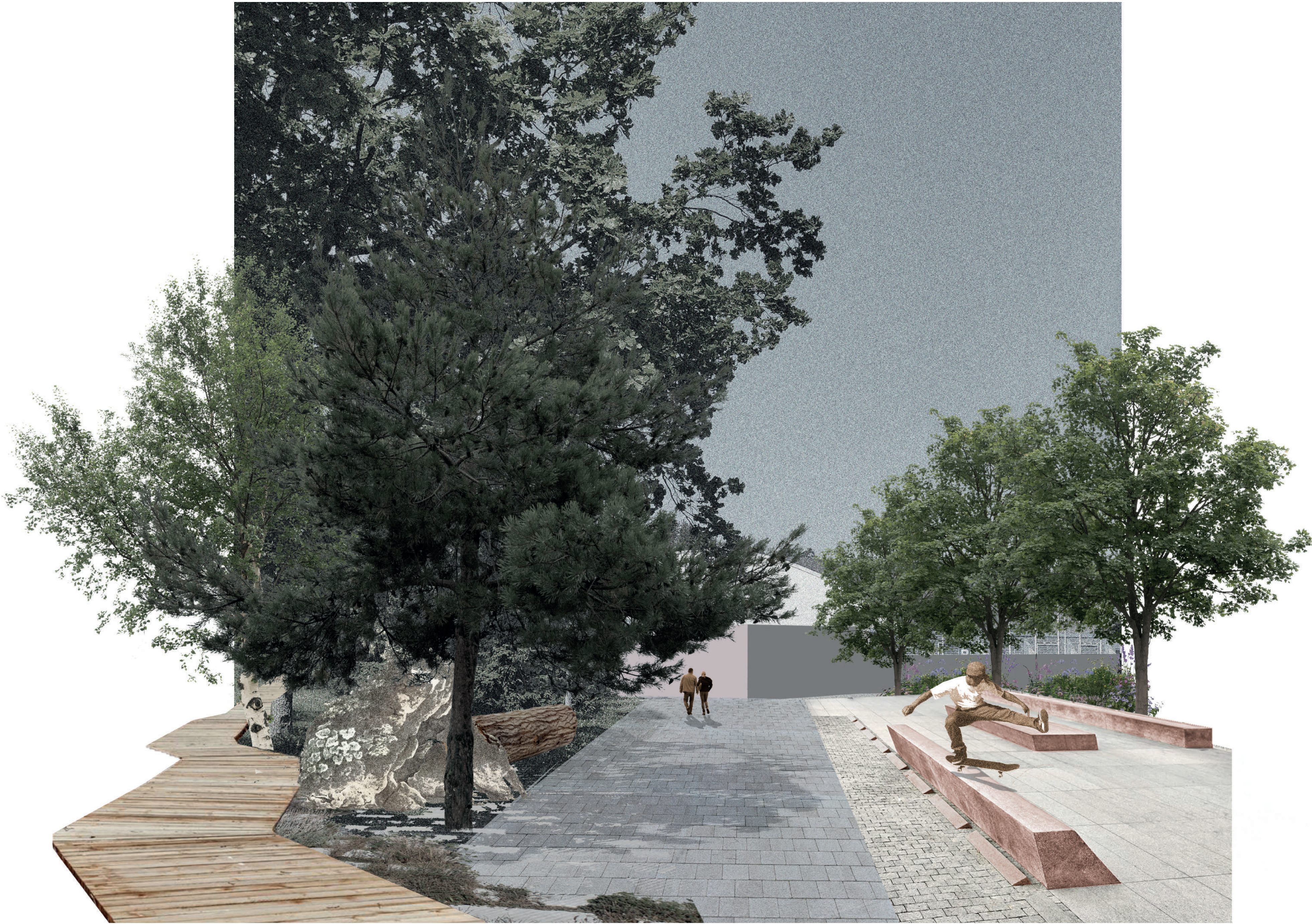
Perspective from the central area, along the pathway leading to the new annex building of the Suurhalli complex. Framing the view are two key axes: the Green axis and microforest to the right, and the Active axis and functional plaza to the left.