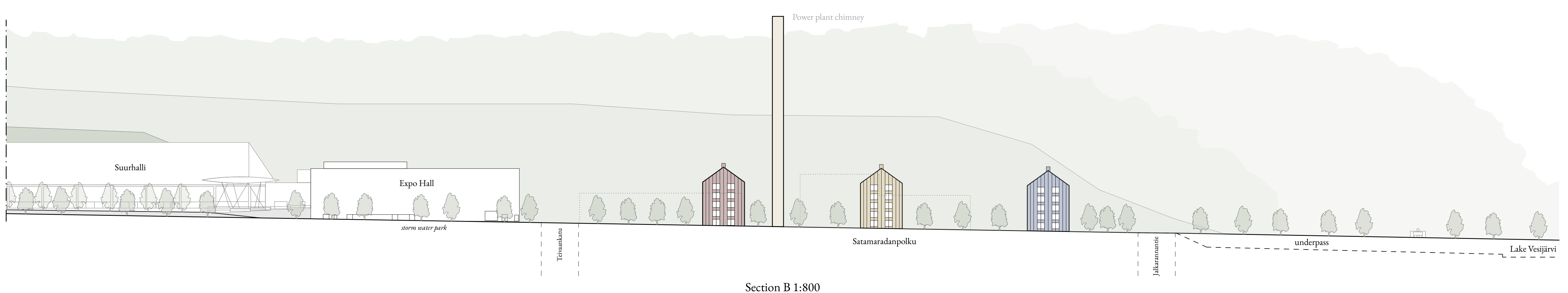
Section B 1:800