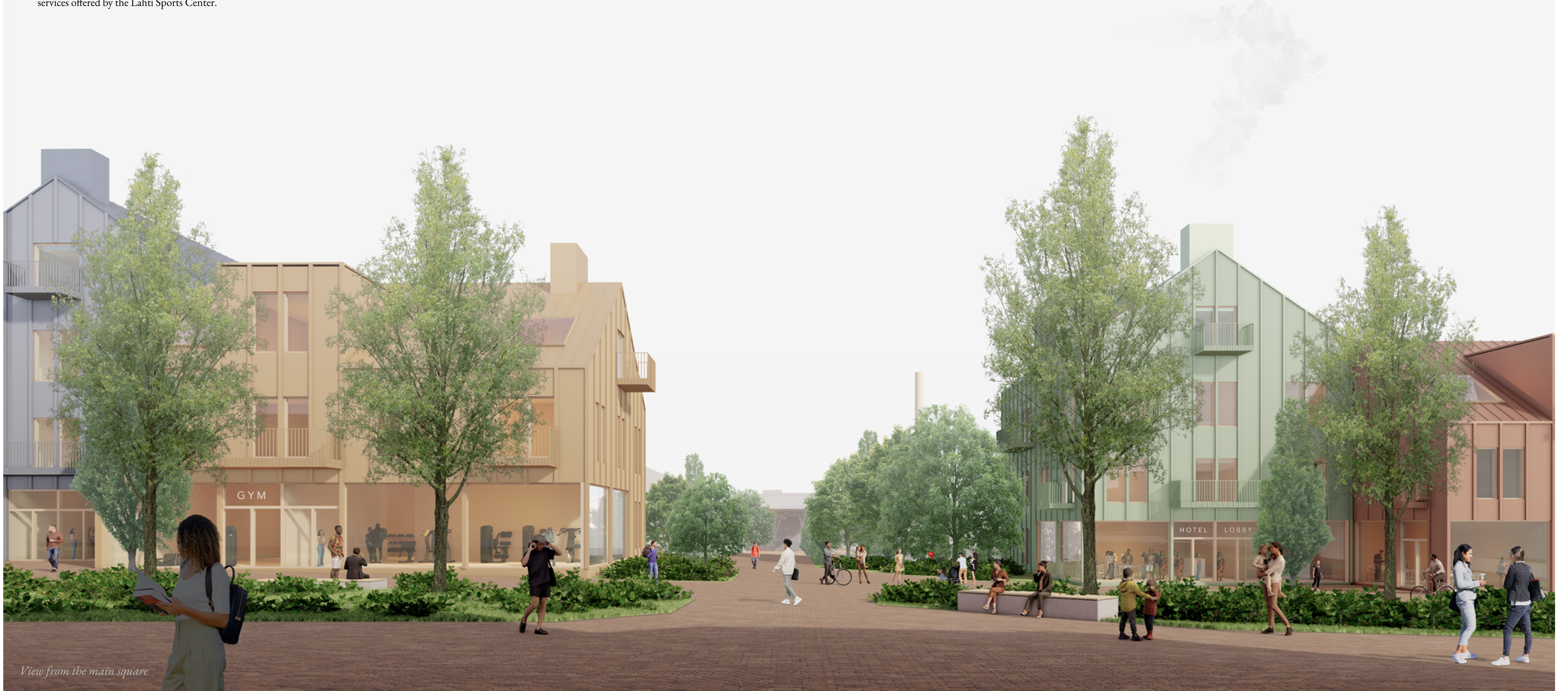
View from the main square

Especially the location of the new multi-purpose hall, water sports center, and outdoor swimming pool will significantly improve the existing situation by enlivening the intersection area and sports center. The development and year-round use of the area will also be supported by a sports hotel equipped with versatile functions and an associated central square. The art dedicated to the site strengthens the area's identity, cityscape and improves orientation. Local artists are used in the creation of the art and natural elements and recycled materials are preferred. The plan has designated new pedestrian routes and small paths that connect new urban spaces and buildings to existing routes. The route system supports movement and encourages to recreation and use of the services offered by the Lahti Sports Center.