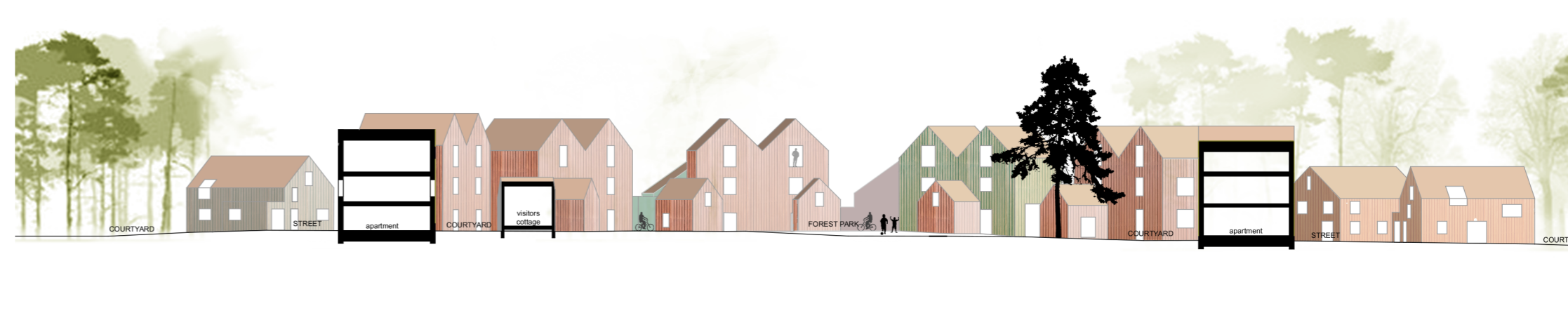
Section 2 - townhouses 1:500