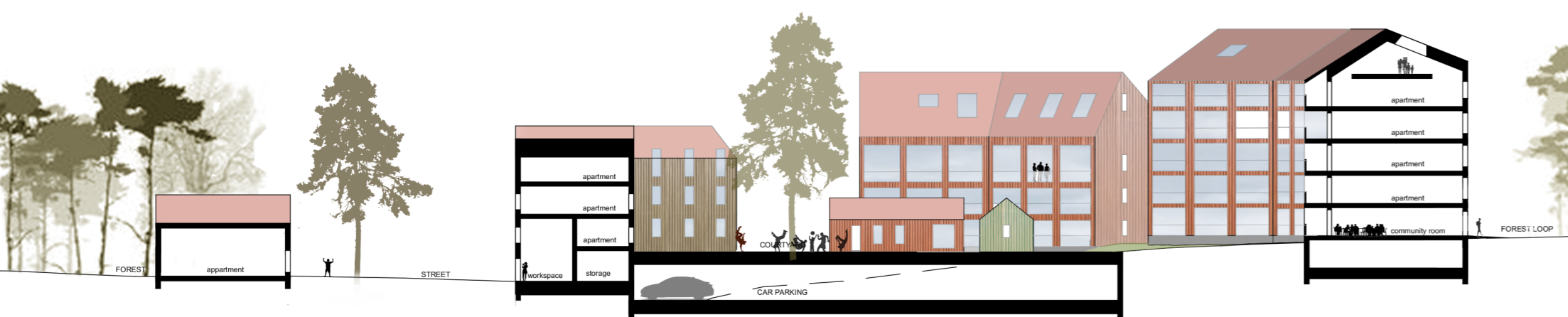
Section 1 - urban block 1:500