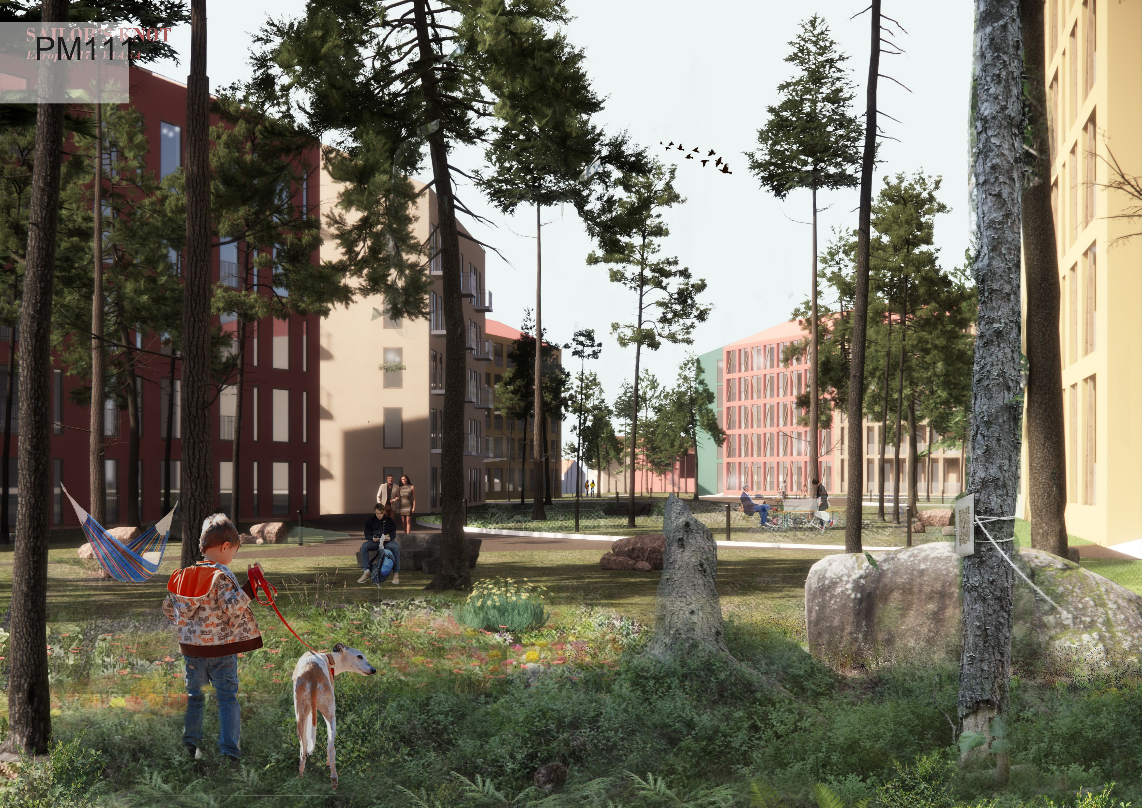
Perspective from a new park